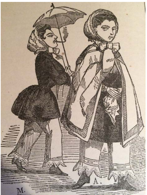
Figure 1 : Women unsettling the gender divide through street fashion. ( Guía Satírica ).

taken root among the city's female population. Sinéad Furlong, discussing the fashion mandates of 1860s Parisian tourist guidebooks, notes that "strict etiquette was necessary in terms of dress if one was not to be mistaken for a prostitute. In all this, the attitude was that men had roving eyes and that it was the woman's job to take care to deflect this gaze" with the symbolic language of dress (245). And while the tone of Angelón's chapter, in which he argues that "las modas femeninas van tomando un sabor masculino muy pronunciado" and that "todavia no son de uso entre las señoras botas de montar, pero no hemos de pasar mucho tiempo sin conseguirlo" (69), is ironic and biting, these critiques nevertheless reveal women's increasing movement into more masculine terrains, and the way in which the blurring of masculine and feminine demeanors provoked a reinscription of traditional gender divisions in this era.