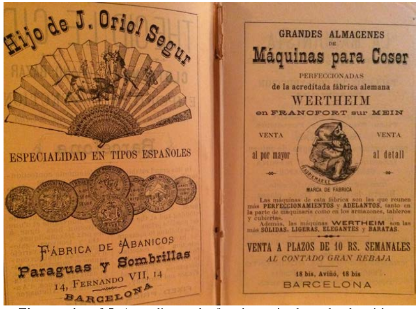
Figures 4 and 5 : Appealing to the female tourist through advertising. ( Barcelona en la mano )

home management and decoration had become a labor that defined middle class Spanish women in this era.